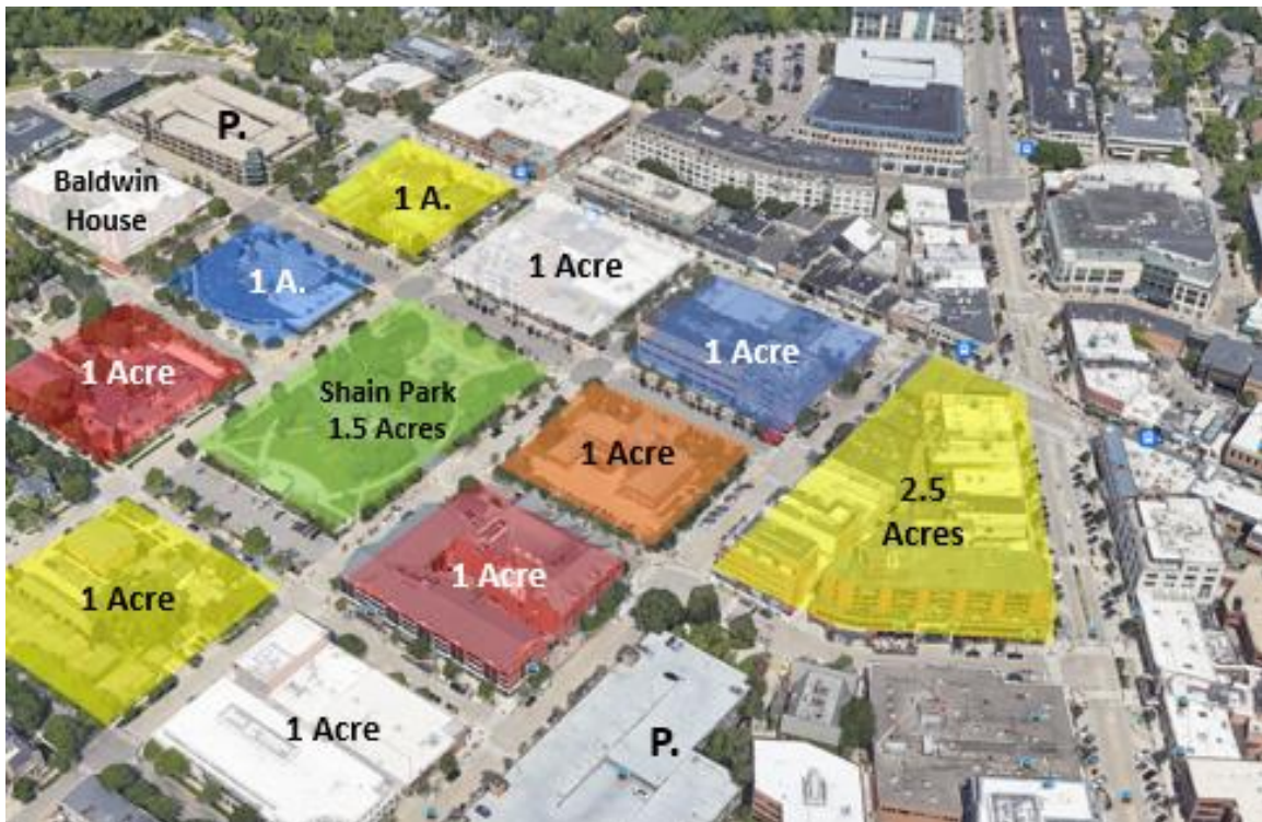
Figure 2: Downtown Birmingham's Block Grid