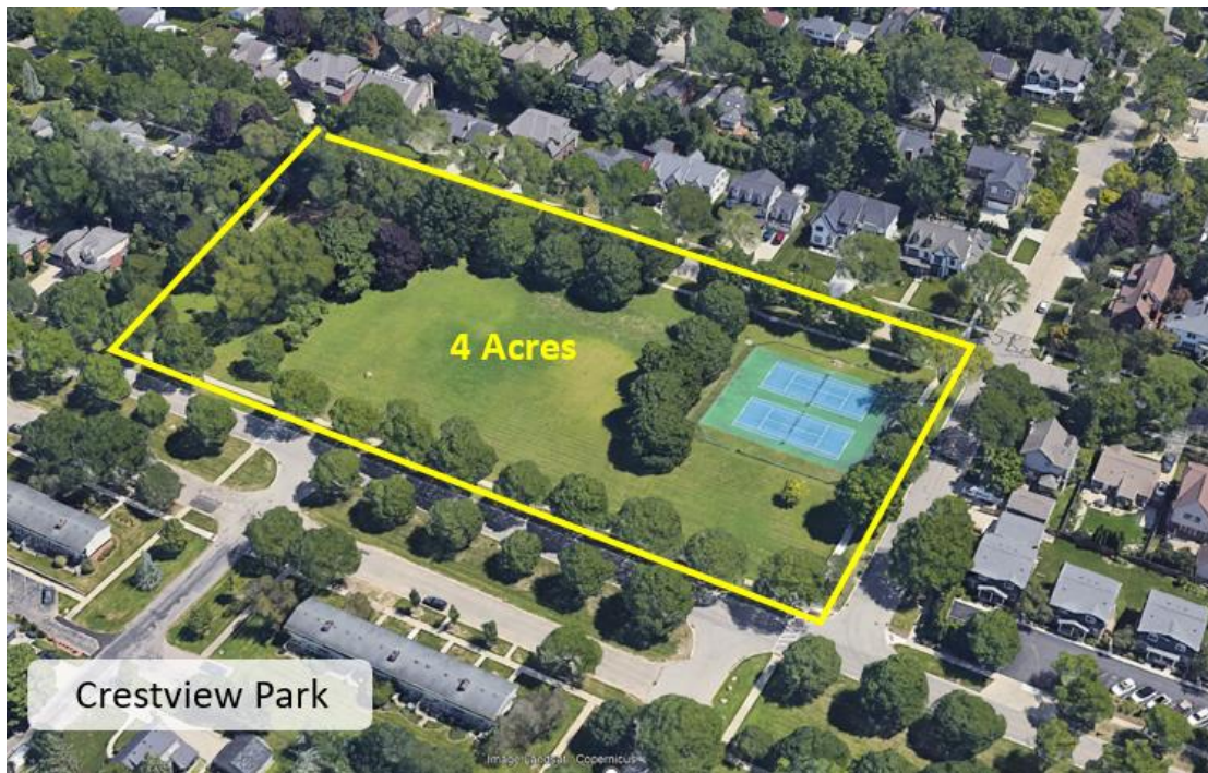
Figure 3: Crestview Park's 4-acres equates to 4 city blocks