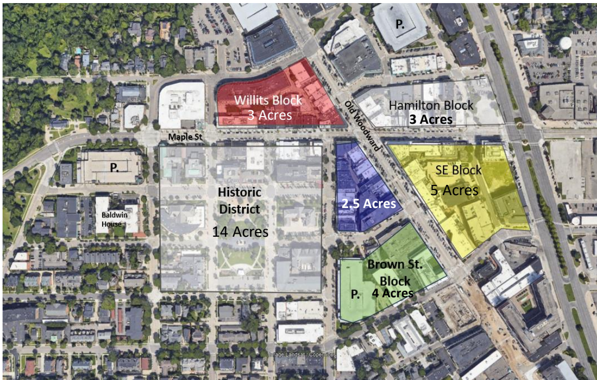
Figure 1: Downtown Birmingham's 60-acre Block Grid, The Historic District's 1-acre blocks are based on the Jefferson Grid