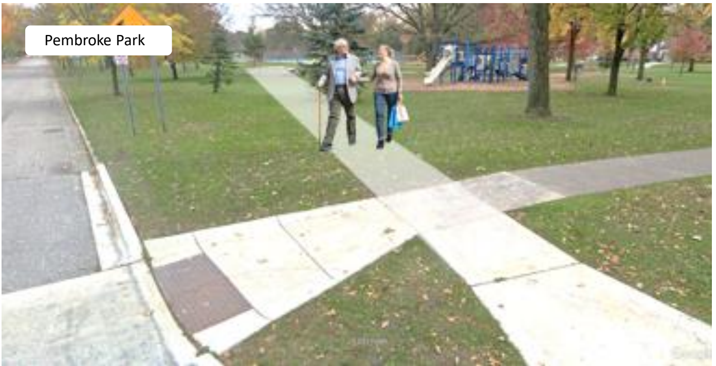
Figure 8: Pembroke Park looking southeast from Eaton and Windemere Streets – Proposed walkway improvement