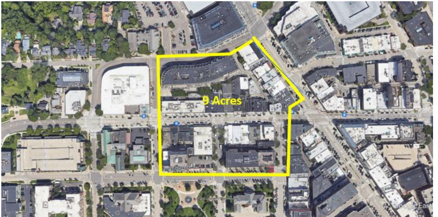
Figure 12: Barnum Park's comparison to downtown Birmingham