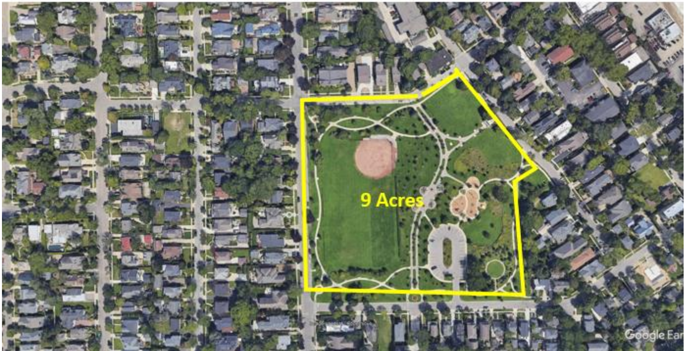
Figure 11: Barnum Park's 9-acres equates to 9 city blocks