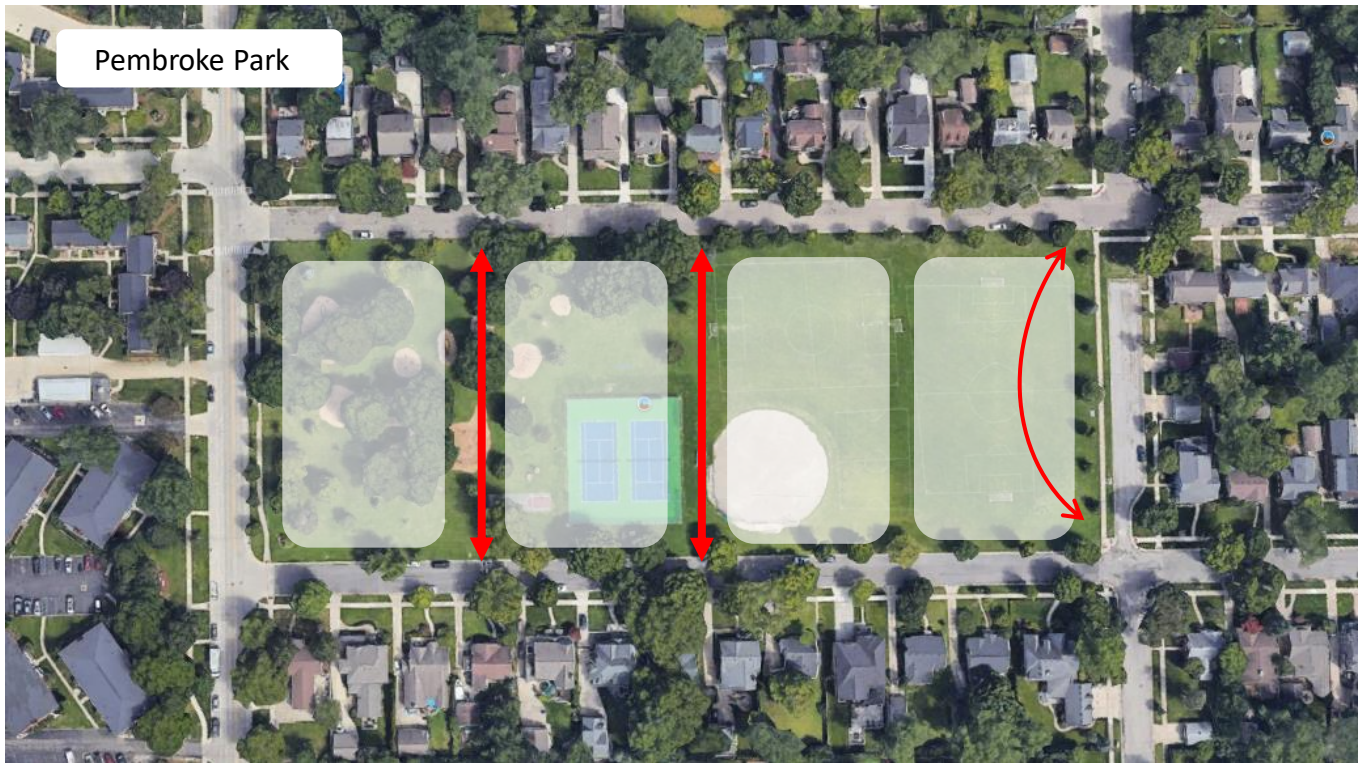
Figure 6: Pembroke Park planned into 1-acre walkable zones.