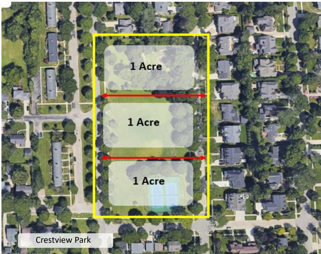
Figure 4: Crestview divided into 3 zones walkable zones.