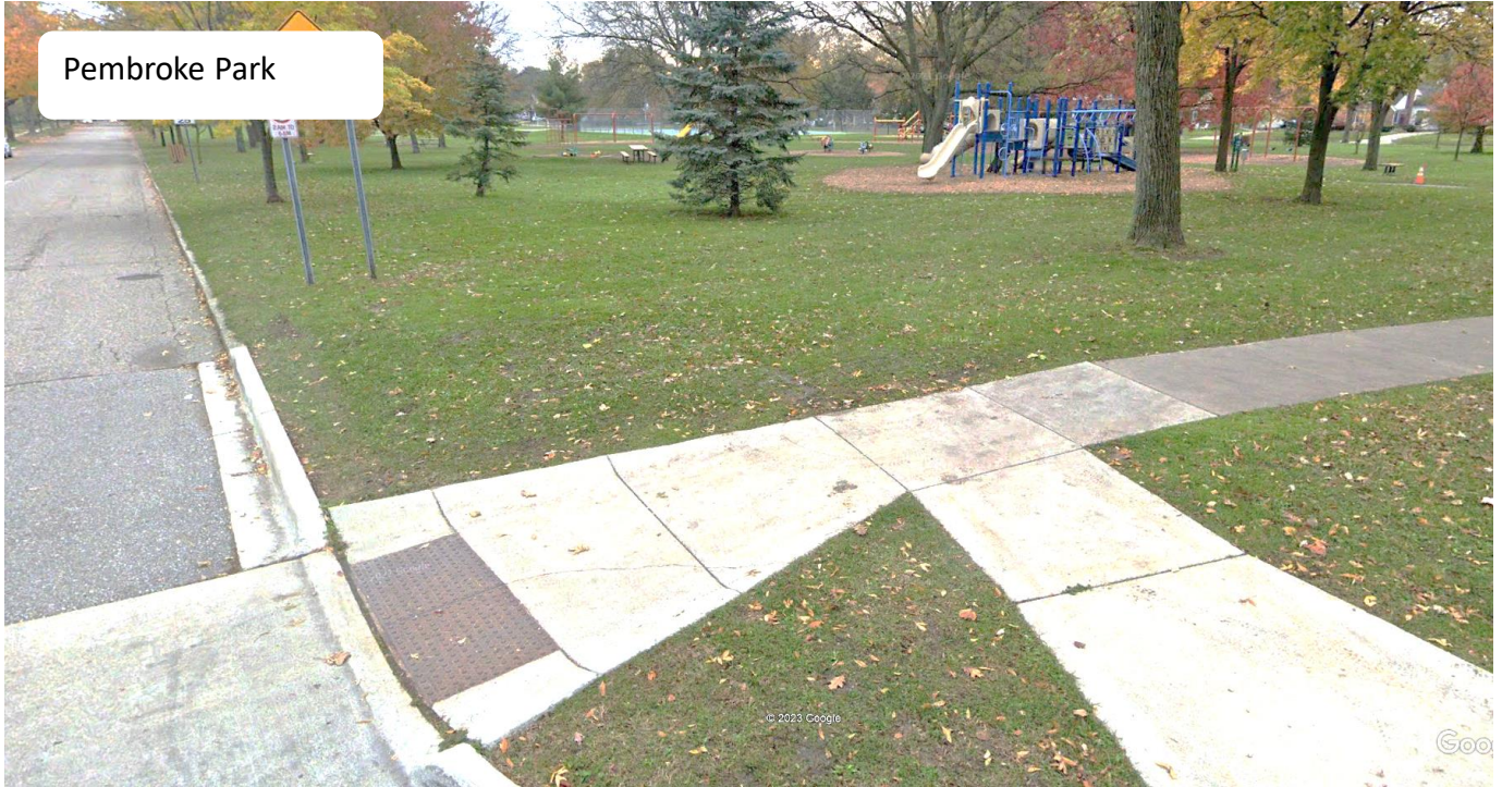
Figure 7: Pembroke Park looking southeast from Eaton and Windemere Streets – Existing View